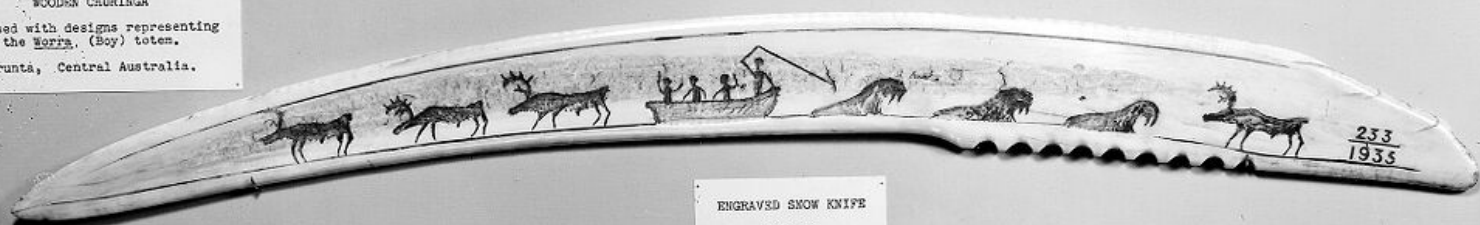
ENGRAVED SNOW KNIFE Eskimo.

Incised with designs representing the Worra . (Boy) totem. Arundt, Central Australia.