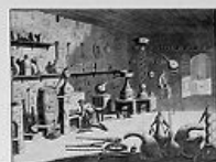
A laboratory in 1780. The apparatus is a large furnace, used for the preparation of alkalis. The room is a part of the laboratory of the University of Göttingen.