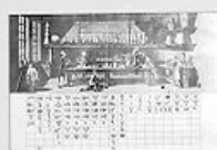
A laboratory in 1780. The apparatus is a large furnace, used for the preparation of alkalis. The room is a part of the laboratory of the University of Göttingen.