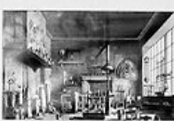
A laboratory in 1780. The apparatus is a large furnace, used for the preparation of alkalis. The room is a part of the laboratory of the University of Göttingen.