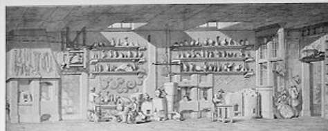
The laboratory of the University of Göttingen, built in 1780. The building is a part of the laboratory of the University of Göttingen. The apparatus is a large furnace, used for the preparation of alkalis. The room is a part of the laboratory of the University of Göttingen.