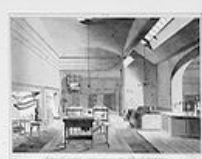
A laboratory in 1780. The apparatus is a large furnace, used for the preparation of alkalis. The room is a part of the laboratory of the University of Göttingen.