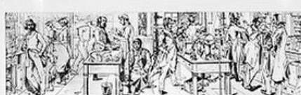
A laboratory in 1780. The apparatus is a large furnace, used for the preparation of alkalis. The room is a part of the laboratory of the University of Göttingen.