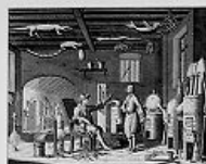
A laboratory in 1780. The apparatus is a large furnace, used for the preparation of alkalis. The room is a part of the laboratory of the University of Göttingen.