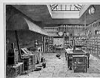
A laboratory in 1780. The apparatus is a large furnace, used for the preparation of alkalis. The room is a part of the laboratory of the University of Göttingen.