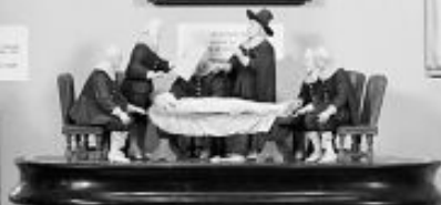
A miniature model or diorama, possibly depicting a dining table or a social gathering.