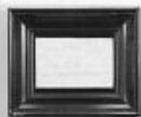
Small framed portrait or document.