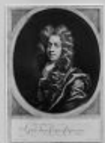
Portrait of a man, likely a Dutch artist or patron, displayed in an oval frame.