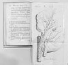
Anatomical diagram or technical drawing, possibly related to a human figure.