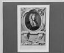
Portrait of a woman, likely a Dutch artist or patron, displayed in an oval frame.