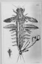
Anatomical diagram or technical drawing, possibly related to a plant or insect.