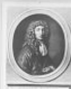
Portrait of a woman, likely a Dutch artist or patron, displayed in an oval frame.

Textual information, likely a biographical sketch or historical context, positioned centrally at the top of the display.