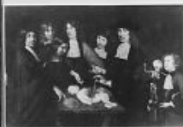
Group portrait painting, possibly depicting a family or a group of figures.