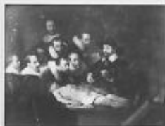
Group portrait painting, possibly depicting a family or a group of figures.