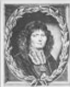
Portrait of a woman, likely a Dutch artist or patron, displayed in an oval frame.

Textual information, likely a biographical sketch or historical context, positioned centrally at the top of the display.