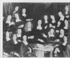
Group portrait painting, possibly depicting a family or a group of figures.