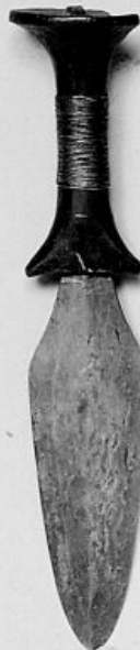
KNIFE Used for all surgical purposes including circumcision.