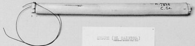
SCISSOR (EL SAIRSHA) Used to catch and draw forward the uvula for excision with a knife.