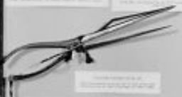
Illustration of a surgical instrument, possibly a pair of forceps, from a historical text.