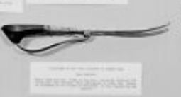
Illustration of a surgical instrument, possibly a pair of forceps, from a historical text.