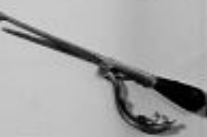
Illustration of a surgical instrument, possibly a pair of forceps, from a historical text.