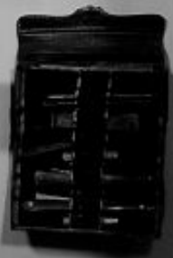
Illustration of a surgical instrument, possibly a pair of forceps, from a historical text.