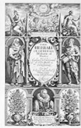
THE EARLY HERBALS