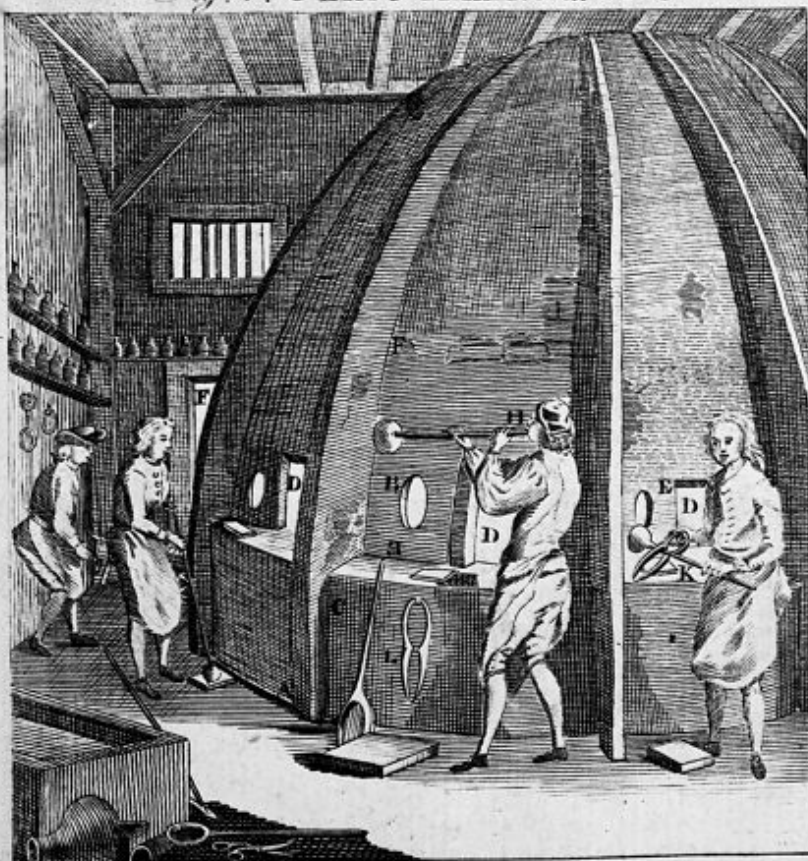
Fig. 1. GLASS MAKERS at Work