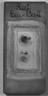
THE EYE-BALL OF THE RAT