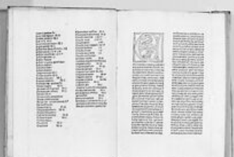
An open book showing two pages of text, possibly a manuscript or a printed book.