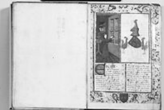
An open book showing two pages of text, possibly a manuscript or a printed book.