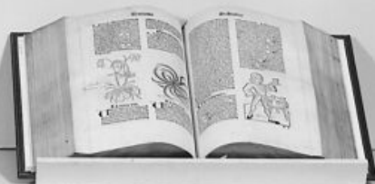
An open book showing two pages of text, possibly a manuscript or a printed book.