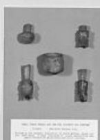
A small, ornate ceramic vessel, possibly a vase or a jar, with a dark, patterned surface.