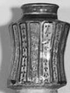
A tall, ornate ceramic vessel, possibly a vase or a jar, with a dark, patterned surface.

The history of the clock is a story of the struggle for accuracy. The first clocks were simple devices that measured time by the length of a day. As the need for more precise timekeeping grew, the clockmakers of the Middle Ages developed a series of ingenious devices that allowed them to measure time with increasing accuracy. The result was the development of the mechanical clock, which has been the standard for timekeeping ever since.