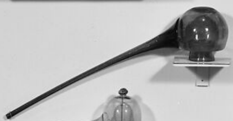
A large, dark, ornate ceramic vessel, possibly a vase or a jar, with a dark, patterned surface.