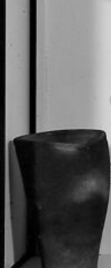
A large, dark, ornate ceramic vessel, possibly a vase or a jar, with a dark, patterned surface.