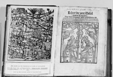
An open book showing two pages of text, possibly a manuscript or a printed book.