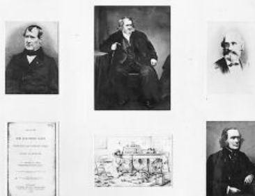
SIR JAMES SIMPSON A ZAVEDENÍ CHLOROFORMOVÉ ANESTHESIE