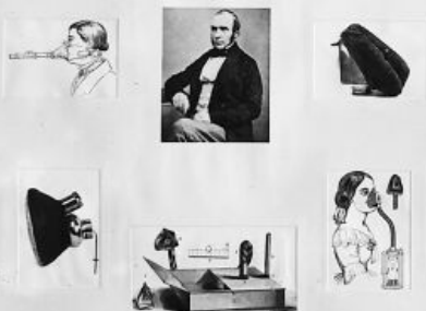
VLIV JOHNA SNOWA NA VÝVOJ INHALAČNÍ ANESTHESIE