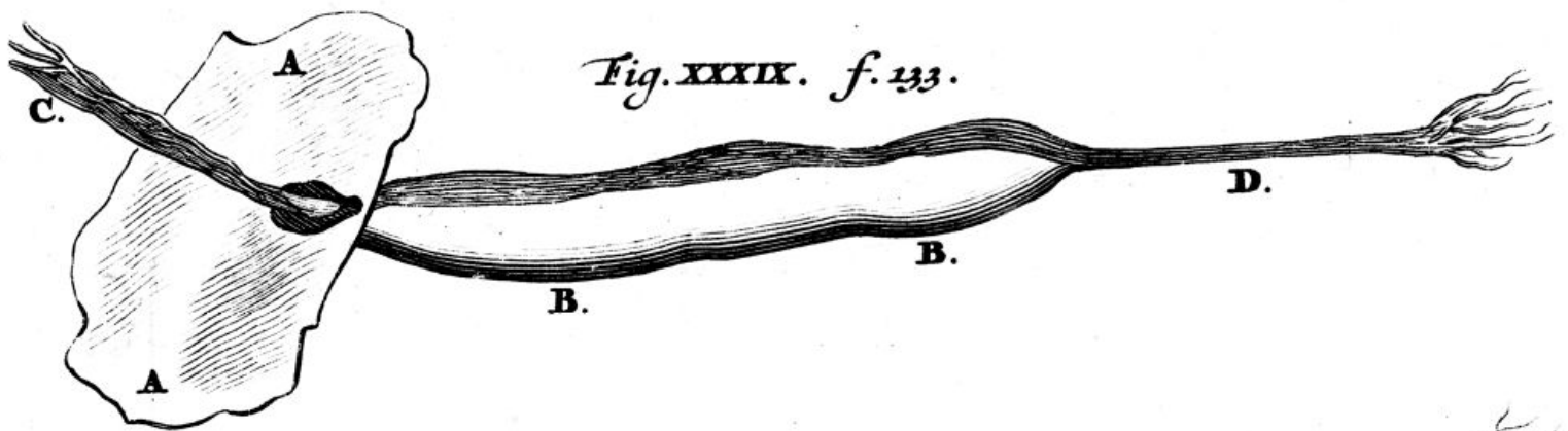
Fig. XXXIX. f. 133.