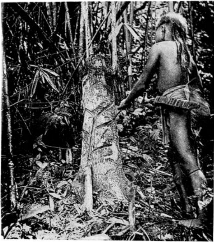
1. SCORING UPAS TREE; THE JUICE COLLECTS IN THE BAMBOO PLACED BELOW VERTICAL CHANNEL.