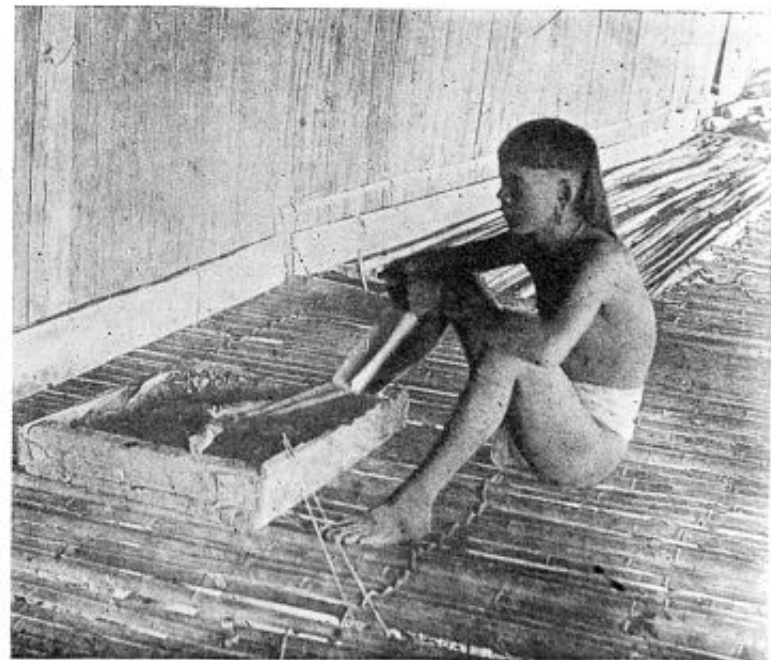
4. MAKING PALM-LEAF VESSEL FOR INSPISSATING THE UPAS JUICE.