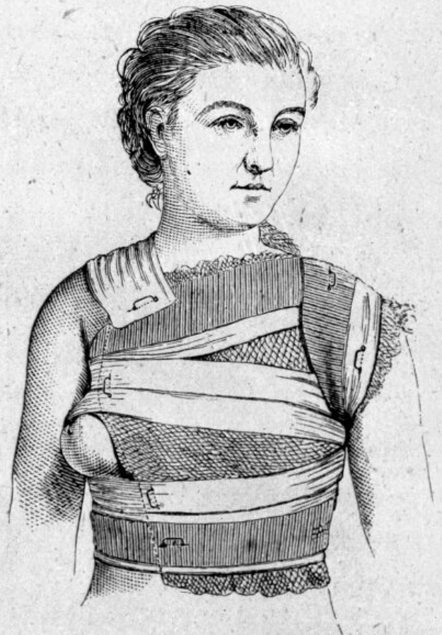
FIG. 42.—BREAST DRESSING NO. 2.

The position of the drainage tube is indicated by dotted lines.