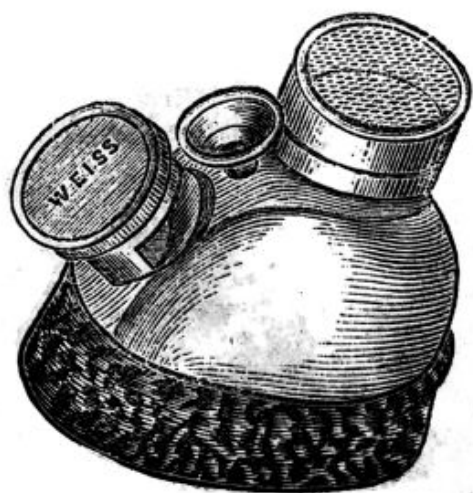
FIG. 9. — Appareil à anesthésie de Sibson.