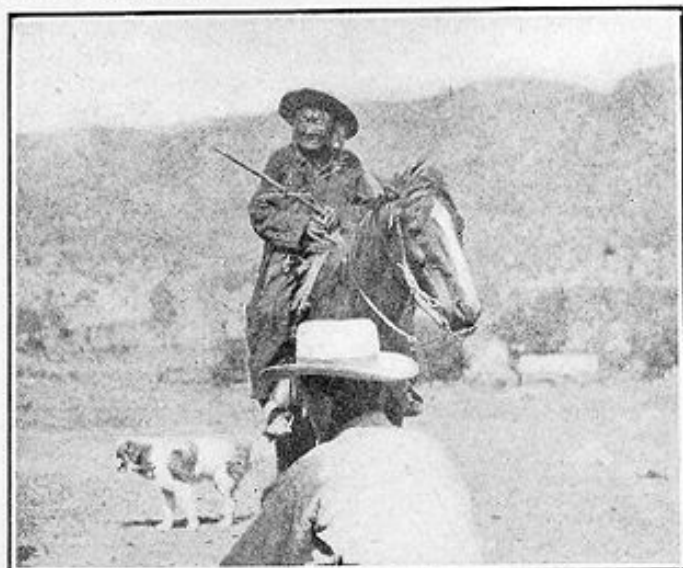
a "BRIGHAM YOUNG," WHITE RIVER APACHE MEDICINE-MAN