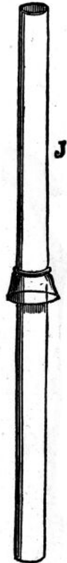
FIG. 18.— Anesthésimètre de Duroy (tube servant à l'introduction de l'air extérieur dans l'appareil).