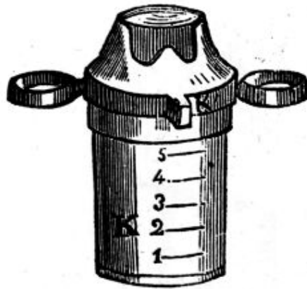
FIG. 15.—Anesthésimètre de Duroy (flacon gradué seul).