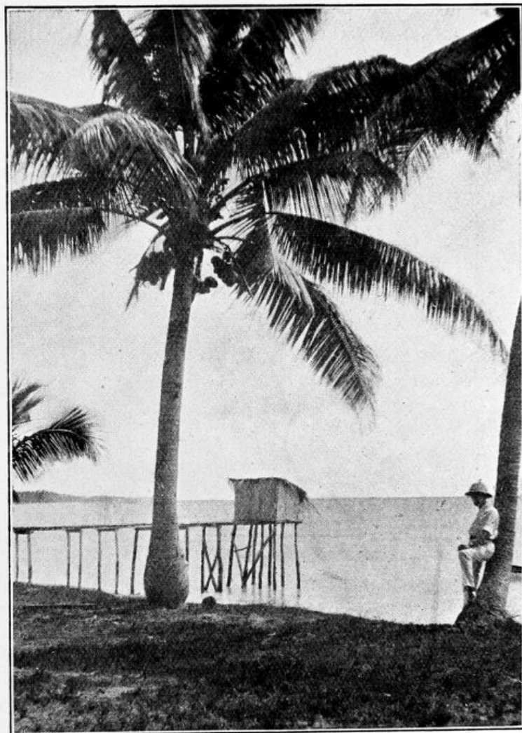
FIG. 4.—Drop Latrine off Shore. Ellice Islands.