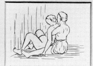
SITTING POSTURE THE HUSBAND SUPPORTING ANDAMAN ISLANDS. Eggenstein. La Pratique des Accouchements. p. 19.