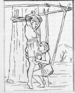
ERECT POSTURE FASTENED TO A TREE TRUNK FOR SUPPORT ISLAND OF CERAM. Eggenstein. La Pratique des Accouchements. p. 19.