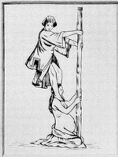
KNEELING POSTURE METHOD OF HASTENING THE DELIVERY KALMUCK, ASIA. Wiedemann. Histoire des Accouchements. p. 387.