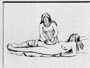
RECUMBENT POSTURE ASSISTANT APPLYING PRESSURE WITH HOT BRICKS PHILIPPINE ISLANDS Wiedemann. Histoire des Accouchements. p. 401.