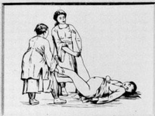
RECUMBENT POSTURE IN DIFFICULT LABOUR THE LEGS ARE SEIZED AND SHAKEN MONGOL, CENTRAL ASIA. Wiedemann. Histoire des Accouchements. p. 387.