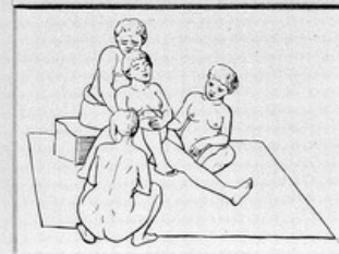
SITTING POSTURE AN ASSISTANT SUPPORTING ANDAMAN ISLANDS. Wiedemann. Histoire des Accouchements. p. 386.