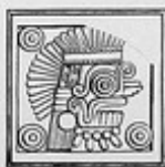
THE RAIN SUN From the Book of the Dead

IN THE ERA NAUI QUIAUITL, FOUR FIRE-RAIN, TLALOC REIGNED AS THE SUN. THIS WAS THE PERIOD OF QUIAUGHTONATIUM, THE FIRE-RAIN SUN, CORRESPONDING TO THE SOUTH. AFTER SEVEN CYCLES, THREE HUNDRED AND SIXTY FOUR YEARS, IT WAS BROUGHT TO AN END WHEN QUETZALCOATL DROVE TLALOC AWAY BY A SHOWER OF FIERY RAIN, WHICH BURNT UP THE EARTH, WHOSE INHABITANTS WERE CHANGED TO BIRDS AND BUTTERFLIES.