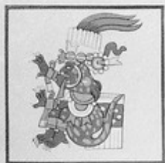
TEZCATLIPOCA IN JAGUAR COSTUME From the Book of the Dead

IN THE ERA NAUI OCELOTL, FOUR JAGUAR, TEZCATLIPOCA REIGNED AS THE SUN. THIS PERIOD WAS THAT OF OCELOTONATIUM, THE EARTH OR JAGUAR SUN, CORRESPONDING TO THE NORTH, DURING WHICH GIANTS LIVED ON EARTH. AFTER THIRTEEN CYCLES, SIX HUNDRED AND SEVENTY-SIX YEARS, QUETZALCOATL HURLED TEZCATLIPOCA DOWN FROM HEAVEN. THUS THE SUN PERISHED. TEZCATLIPOCA BECAME A JAGUAR WHO ATE THE GIANTS, AND THE WORLD CAME TO AN END IN DARKNESS.