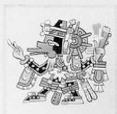
QUETZALCOATL, THE WIND GOD From the Book of the Dead

IN THE ERA NAUI ECATL, FOUR WIND, QUETZALCOATL REIGNED AS THE SUN INSTEAD OF TEZCATLIPOCA. HIS REIGN WAS ECATONATIUM, THE WIND SUN, CORRESPONDING TO THE EAST. AFTER A FURTHER SIX HUNDRED AND SEVENTY-SIX YEARS, TEZCATLIPOCA CAST DOWN QUETZALCOATL WITH A BLOW OF HIS PAW, CAUSING A HURRICANE WHICH DESTROYED THE WORLD, WHOSE INHABITANTS WERE CHANGED INTO APES.