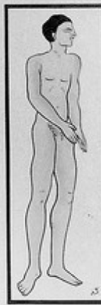
A GIANT OF THE EARTH AGE