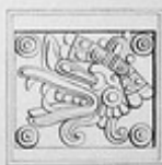
THE WIND SUN From the Book of the Dead

IN THE ERA NAUI ECATL, FOUR WIND, QUETZALCOATL REIGNED AS THE SUN INSTEAD OF TEZCATLIPOCA. HIS REIGN WAS ECATONATIUM, THE WIND SUN, CORRESPONDING TO THE EAST. AFTER A FURTHER SIX HUNDRED AND SEVENTY-SIX YEARS, TEZCATLIPOCA CAST DOWN QUETZALCOATL WITH A BLOW OF HIS PAW, CAUSING A HURRICANE WHICH DESTROYED THE WORLD, WHOSE INHABITANTS WERE CHANGED INTO APES.