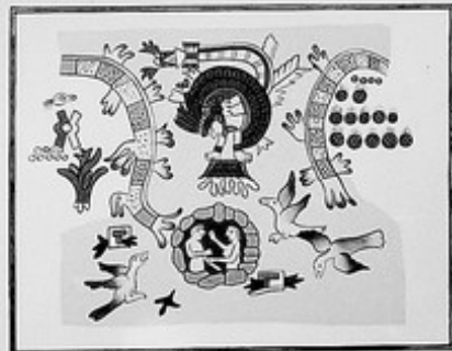
THE END OF THE FIRE-RAIN AGE