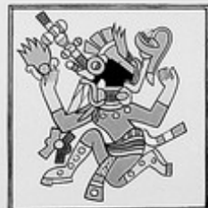
TLALOC From the Book of the Dead