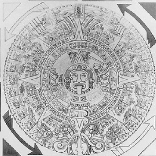
THE FOUR AGES OF THE WORLD