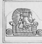
THE WATER SUN From the Book of the Dead

IN THE ERA NAUI ATL, FOUR WATER, QUETZALCOATL ESTABLISHED HIS WIFE CHALCHIHTLICUE AS THE SUN. HER REIGN WAS ATONATIUM, THE WATER SUN, CORRESPONDING TO THE WEST. IN IT THERE WAS CONSTANT RAIN, AND AFTER SIX CYCLES, THREE HUNDRED AND TWELVE YEARS, THE WORLD PERISHED IN A DELUGE. HUMAN BEINGS WERE CHANGED INTO FISH, AND THE HEAVENS FELL DOWN UPON THE EARTH.