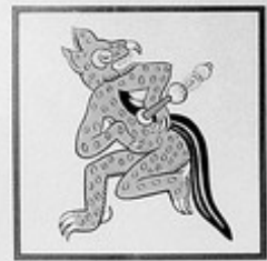
TEZCATLIPOCA FALLING FROM HEAVEN IN THE FORM OF A JAGUAR