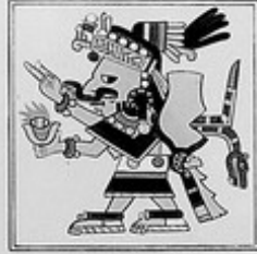
CHALCHIHTLICUE From the Book of the Dead