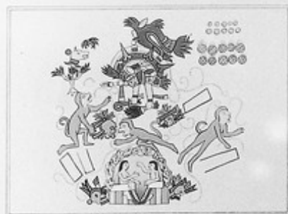
THE END OF THE WIND AGE