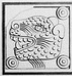
THE JAGUAR SUN From the Book of the Dead

IN THE ERA NAUI OCELOTL, FOUR JAGUAR, TEZCATLIPOCA REIGNED AS THE SUN. THIS PERIOD WAS THAT OF OCELOTONATIUM, THE EARTH OR JAGUAR SUN, CORRESPONDING TO THE NORTH, DURING WHICH GIANTS LIVED ON EARTH. AFTER THIRTEEN CYCLES, SIX HUNDRED AND SEVENTY-SIX YEARS, QUETZALCOATL HURLED TEZCATLIPOCA DOWN FROM HEAVEN. THUS THE SUN PERISHED. TEZCATLIPOCA BECAME A JAGUAR WHO ATE THE GIANTS, AND THE WORLD CAME TO AN END IN DARKNESS.