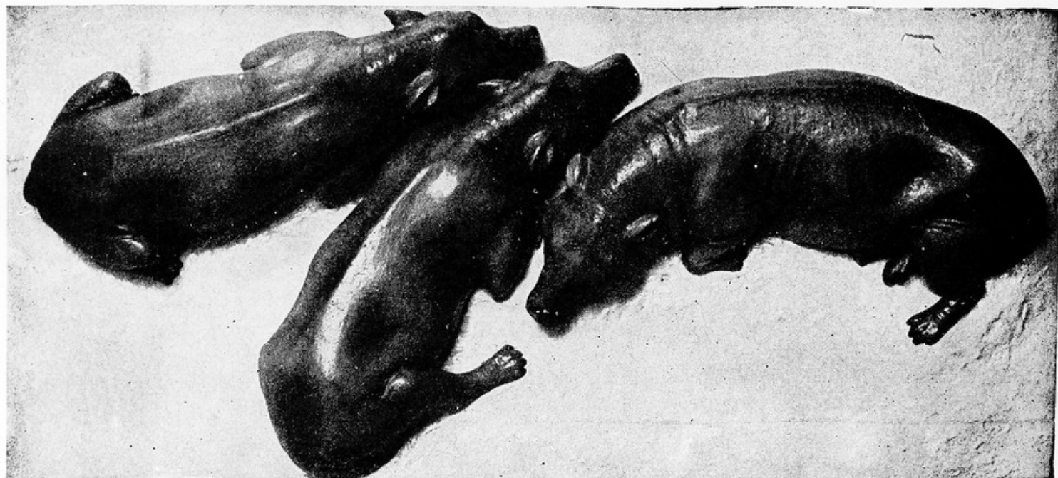
FIG. 5. — A remarkable group of three Miocene oreodonts ( Promerycochærus carrikeri ), buried by a fall of volcanic ash. Above are the skeletons as found huddled together in the rocks; and below, the animals restored in the flesh. Sioux County, Nebraska. Carnegie Museum, Pittsburgh.