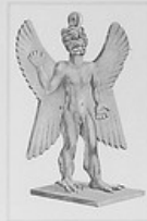
DEMON OF THE SOUTH-WEST WIND FROM BRISTOL MUSEUM IN THE BRITISH MUSEUM

They set him on the road which leadeth to peace and obedience. He strung [his] bow, he set ready his weapon [in the stand]. He fixed his arrow, setting it on the cord. He raised the club, he grasped it in his right hand. A bow and a quiver he hung at his side. He set the lightning in front of him. His body was filled with a glancing flame of fire. He made a net wherewith to enclose Tiamat.