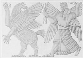
CONFLICT OF MARDUK AND TIAMAT FROM THE BRITISH MUSEUM IN THE BRITISH MUSEUM