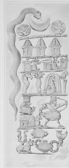
SYMBOLS OF DIVINITIES AND SIGNS OF THE ZODIAC FROM THE BRITISH MUSEUM IN THE BRITISH MUSEUM

BENEATH THE VAULT OF THE SKY, OUT OF THE OTHER HALF OF THE BODY OF TIAMAT, HE FASHIONED THE LOWER VAULT OF THE EARTH; BENEATH THIS EARTH HE ASSIGNED THE WATERS TO EA TO ORDER AND RULE