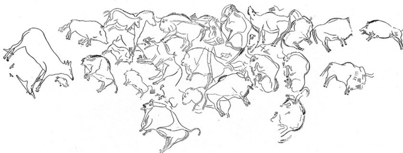
PLAN D'ENSEMBLE DE LA PARTIE GAUCHE DU GRAND PLAFOND DE LA SALLE D'ENTRÉE, LONGUEUR 14 MÈTRES ENVIRON. L'assemblage a été fait sur place avec des silhouettes découpées à l'échelle d'un cinquième.