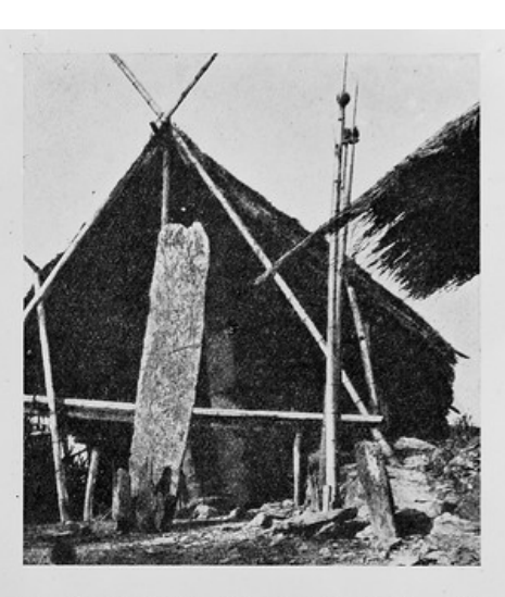
FIG. 3.—INCISED MENHIR IN PHORR. THE GOURDS ON BAMBOO POLES CONTAIN FRAGMENTS OF ENEMY HEADS AND AN ENEMY HAND.