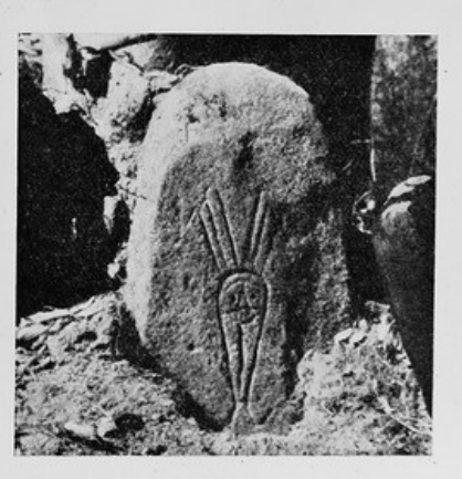
FIG. 4.—PEMBVO'S GRAVE.