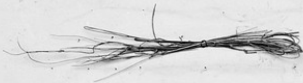
Snares for extracting in-growing eyelashes