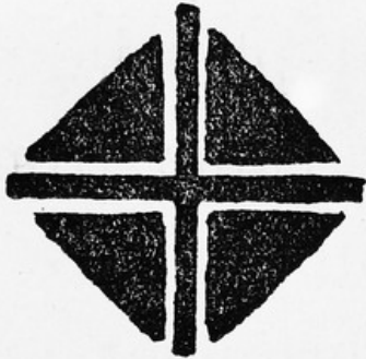
FIG. 1.— Bubu .