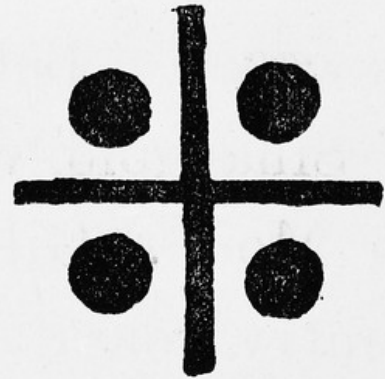
FIG. 2.— Dodo .