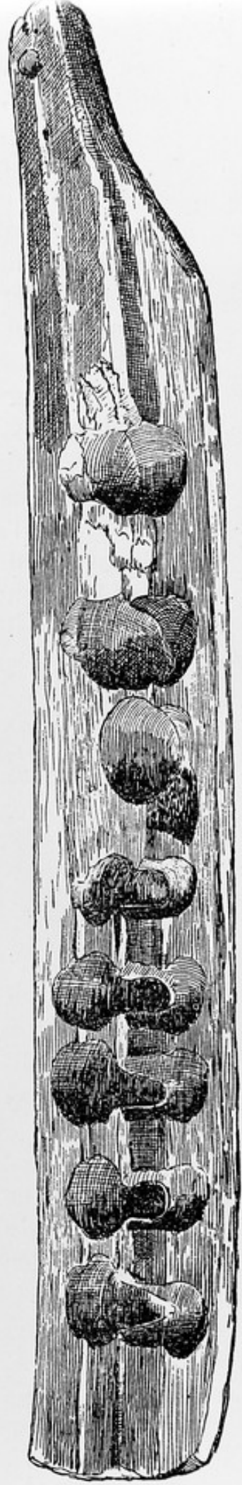
Fig. 35. LOWER PIECE OF FIRE-MAKING SET (hearth).