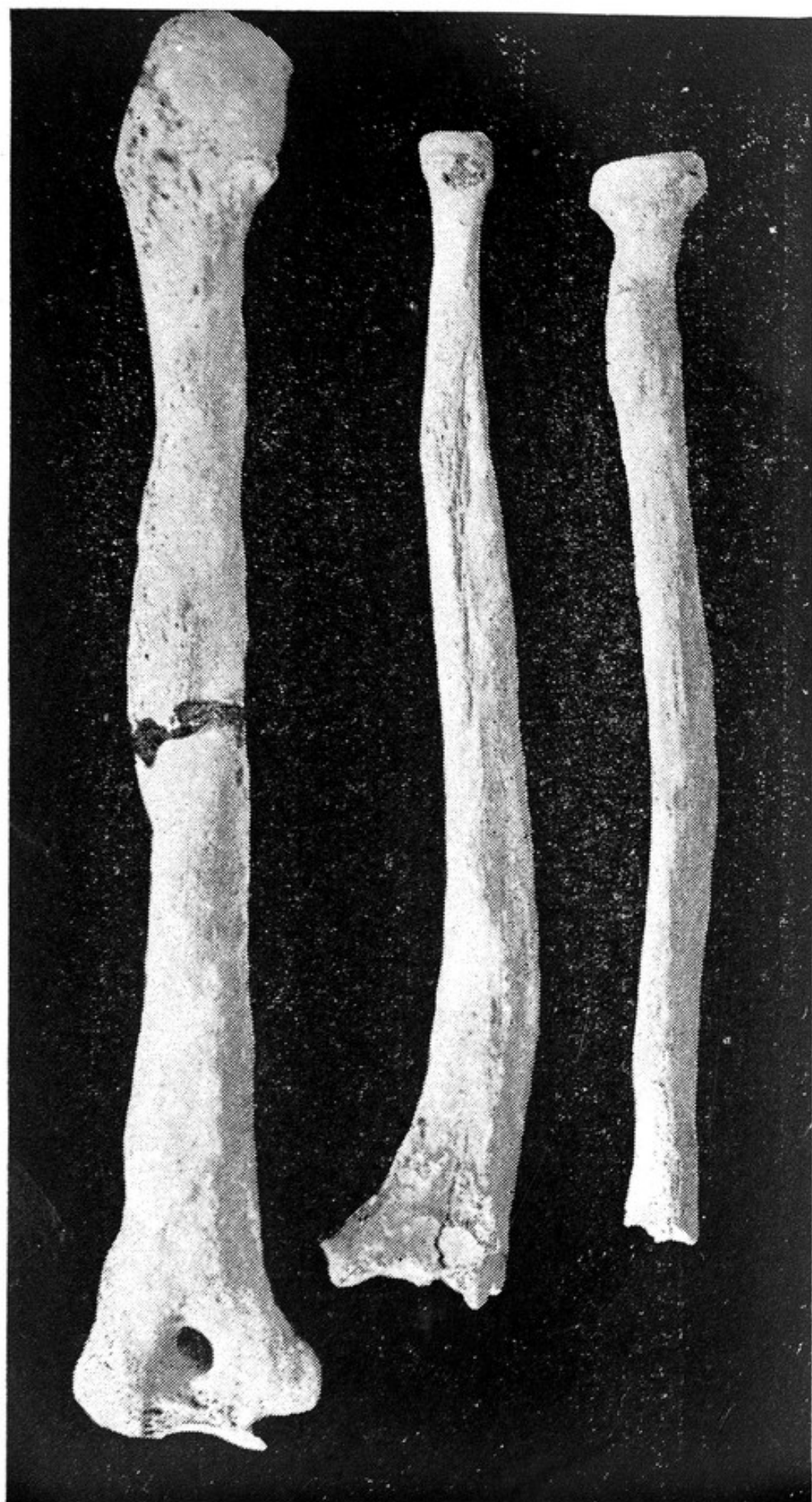
FIG. 6. HUMERUS, RADIUS AND ULNA FROM SKELETON No. 8 (QUINCY, ILL.) SHOWING THE HYPEROSTOTIC CHANGES DESCRIBED IN THE TEXT.