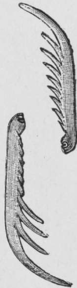
Fig. 152. Scheeren vom Heuschreckenkrebs z. Eröffnen v. Geschwüren, auf Yap (Carolinen).

Mus. f. Völkerkunde, Berlin. Nach Photographie.