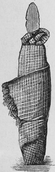
Fig. 151. Kleines Operationsmesser der Haussa (West-Afrika).

Mus. f. Völkerkunde, Berlin. Nach Photographie.