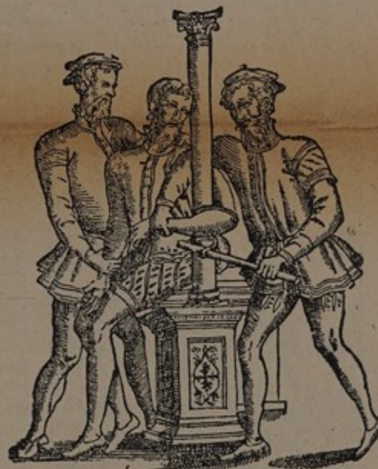
Paré, 1610 nr. 143.

Of greatest importance is the third part, containing Paracelsus' surgical works . — Our copy is absolutely complete (complete copies with all the three parts are very rare) and in very fine condition.