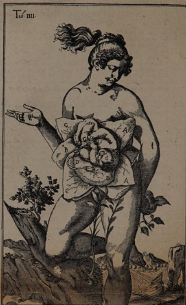
Spigelius, 1645, nr. 153 (very greatly reduced).

First edition of one of the most popular surgical works of the 16th century which was very often reprinted and translated into French, Italian and Dutch. Jean Tagault (died 1545) was a famous French surgeon. "This work became the standard text-book for English students in the 16th century and is often quoted" (Power-Thompson). It is one of the very first works to contain reproductions of the famous skeletons taken from Vesalius' Tabulae anatomicae, 1538. (Feyfer D, 63). Besides we mention Hollerius' surgical work contained at the end after Tagault's treatises. This first edition is very scarce. — Former owner's name and annotations on the title. Partly waterstained