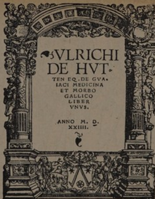
Hutten, 1524, nr. 120 (greatly reduced).

The author gives an elaborate account of the discovery of the healing effects of Guaiacum Wood "on the island of Cuba, which lies towards the West near America, the land which extends towards midnight with its whole length and was also discovered in recent years, with the other recently discovered islands which were unknown to our ancestors". (Fourth chapter: Guaiaci Descriptio et eius inventio ac nomen ). — "Ulrich von Hutten, the greatest name after Luther and Erasmus in the Reformation, suffered with the new disease for many years..... Apart altogether from the unique interest attaching to Hutten as a man, his little book is well worth reading, as giving a graphic first-hand account of syphilis as it appeared early in the sixteenth century" (Osler). — A few interesting contemporary marginal annotations. A very fine and fresh copy. — See reproduction hereby.