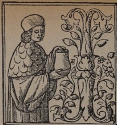
Rhazes, 1506 nr. 146.