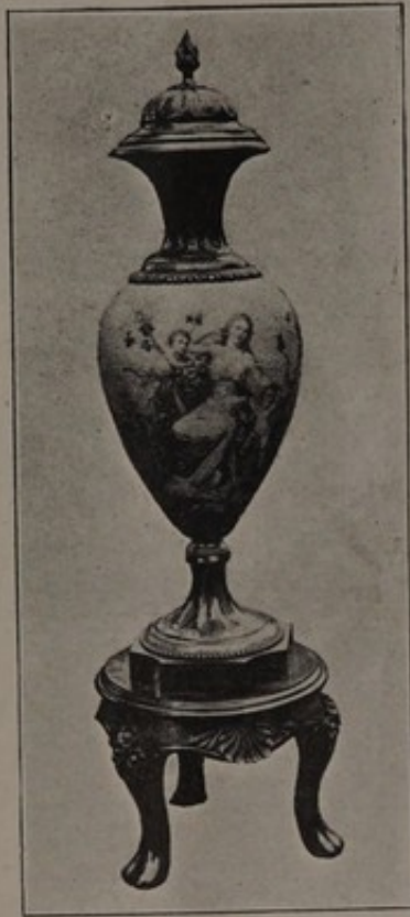
LOTS 3 & 4