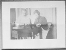
Photograph of two people sitting at a table, possibly in a laboratory setting.