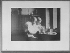
Photograph of a person sitting at a table, possibly in a laboratory setting.