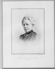
Portrait of a woman.