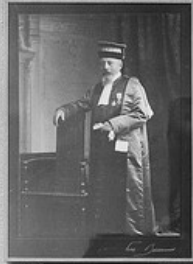
Portrait of a person in a military-style uniform.