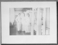
Photograph of three people in a room, possibly a laboratory or office.