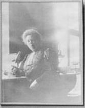
Photograph of a person sitting at a desk, possibly in a laboratory setting.