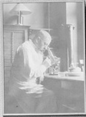
Photograph of a person sitting at a desk, possibly in a laboratory setting.