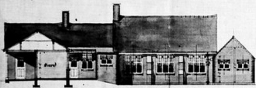
Section D B