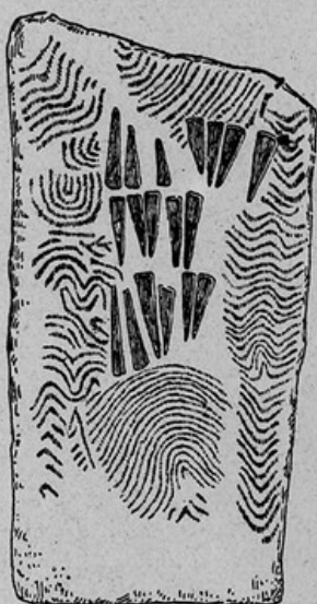
Pierre sculptée. Allée couverte de l'île Gavrinis, commune de Baden (Morbihan) 3 .