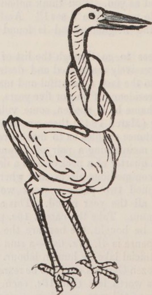
Intended for a Heron.

The learned have discovered a number of mysterious convolutions of the trachea in this genus, but it is doubtful whether all their researches have enabled them to match the subjoined amusing instance from the "Hortus Sanitatis," or "Garden of Health," a rare old book printed in 1491, and enriched by numerous illustrations, that are attributed to Albert Durer.