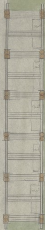
7/16 inch Scale PLAN