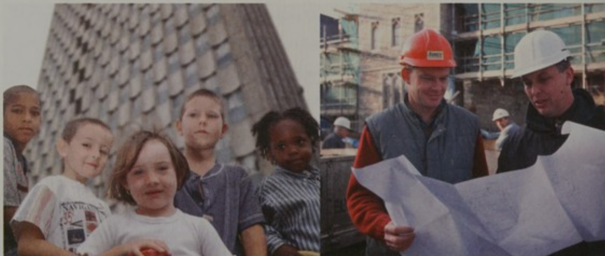
Peterborough City Council – Building Control Services.