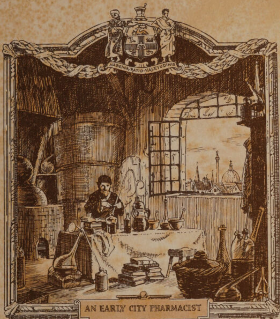
AN EARLY CITY PHARMACIST

Corporation of the City of London Reception in Guildhall to the British Pharmaceutical Conference (Monday 24th July, 1933)