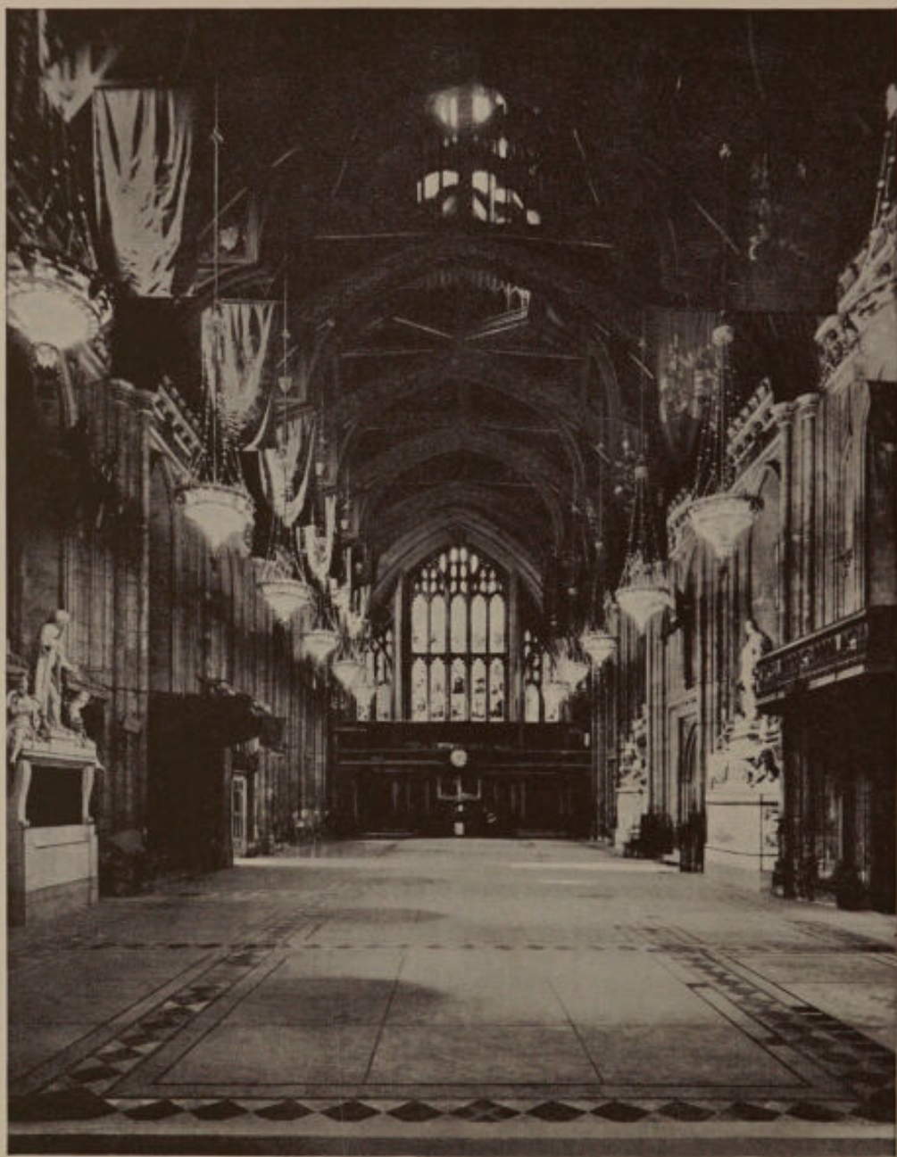
GUILDHALL—THE GREAT HALL