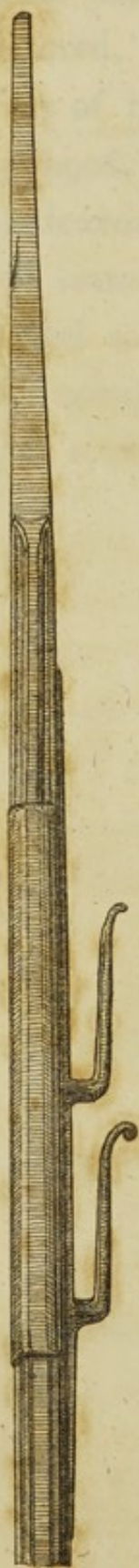
Representation of a portion of the Shaft, with the Finger-irons, on a scale of a quarter of an inch to an inch.