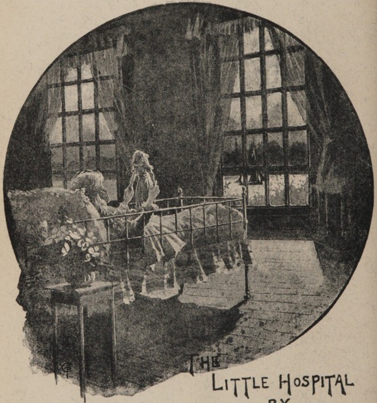
THE LITTLE HOSPITAL BY THE RIVER