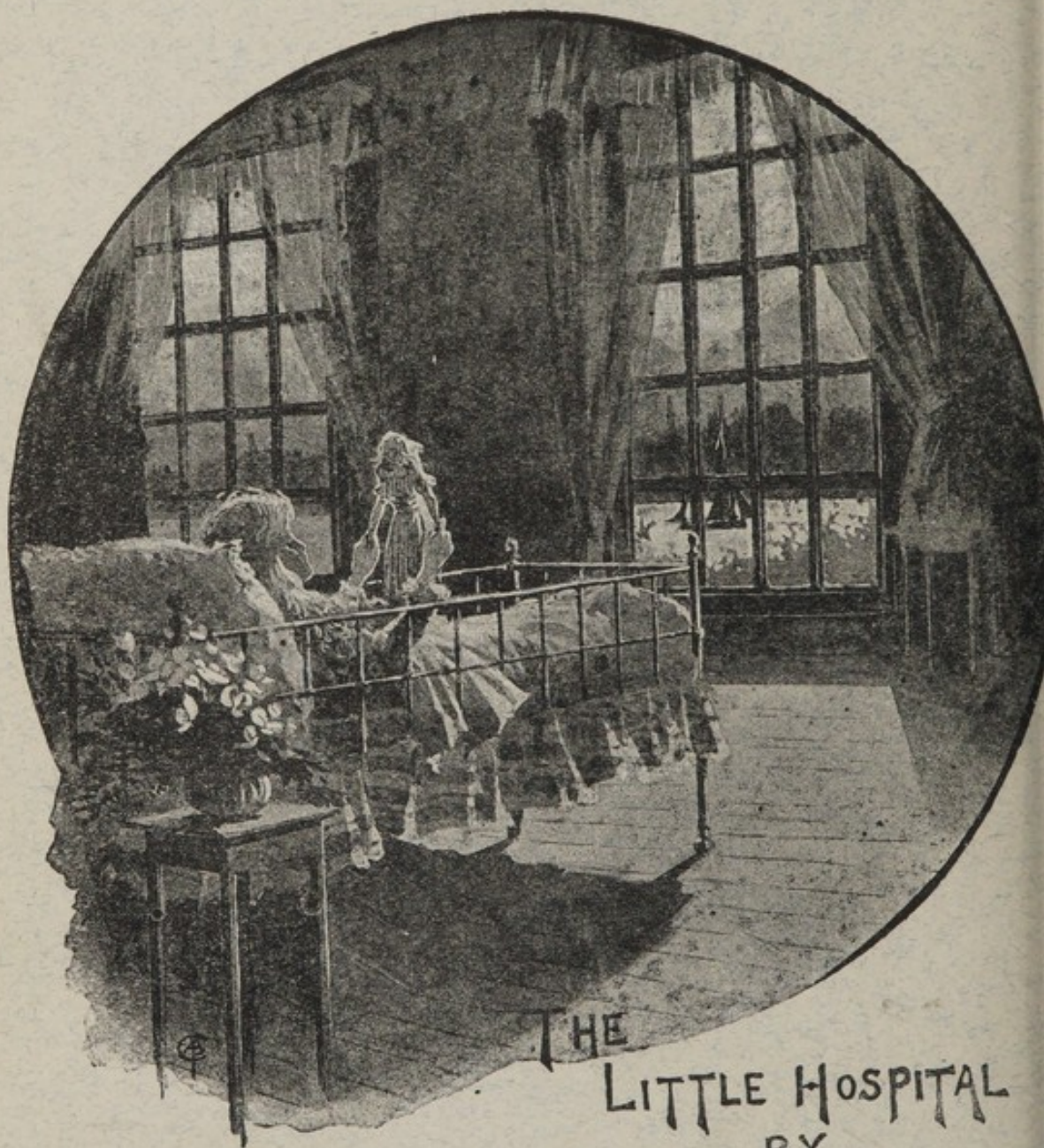
THE LITTLE HOSPITAL BY THE RIVER