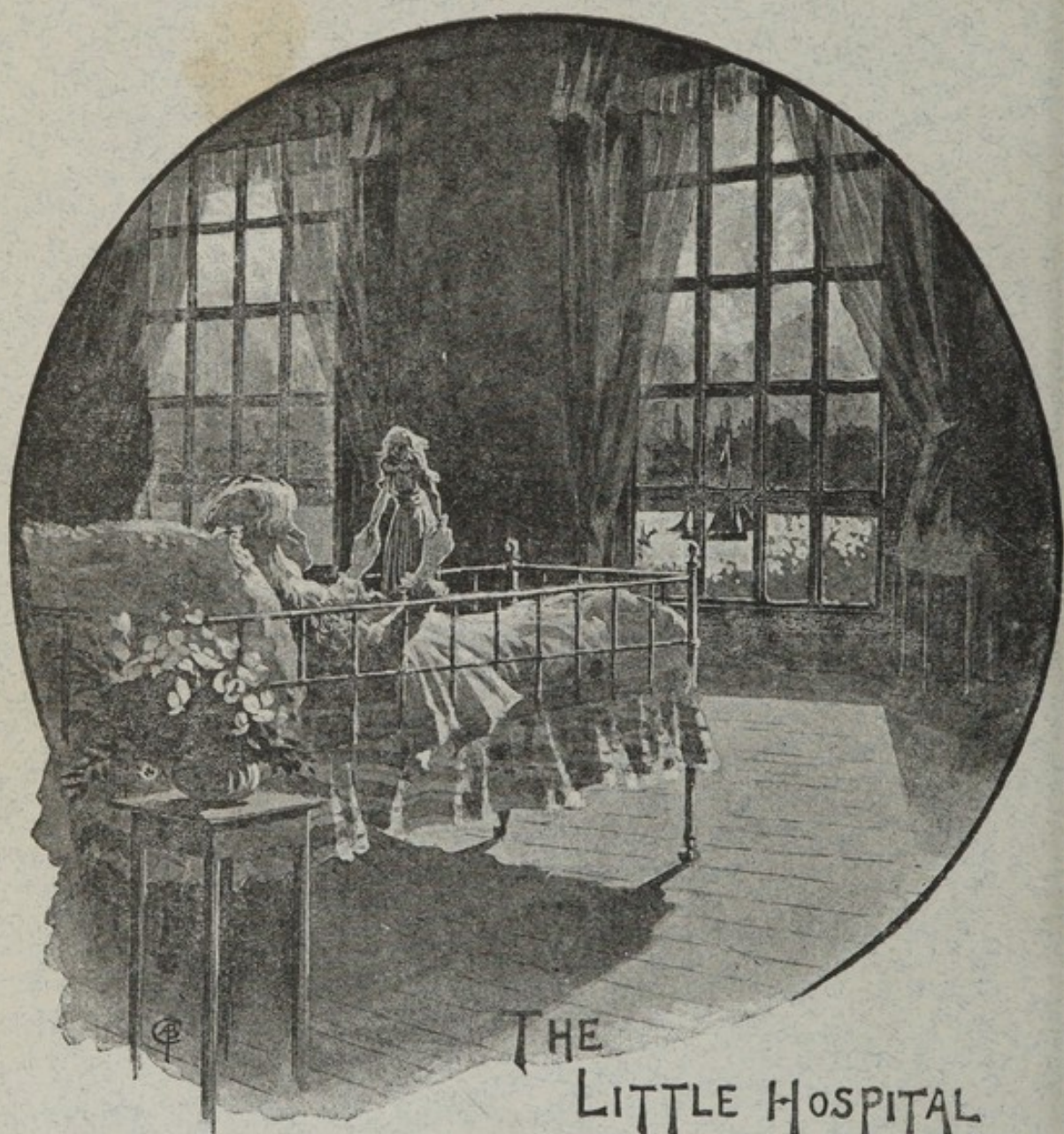
THE LITTLE HOSPITAL BY THE RIVER