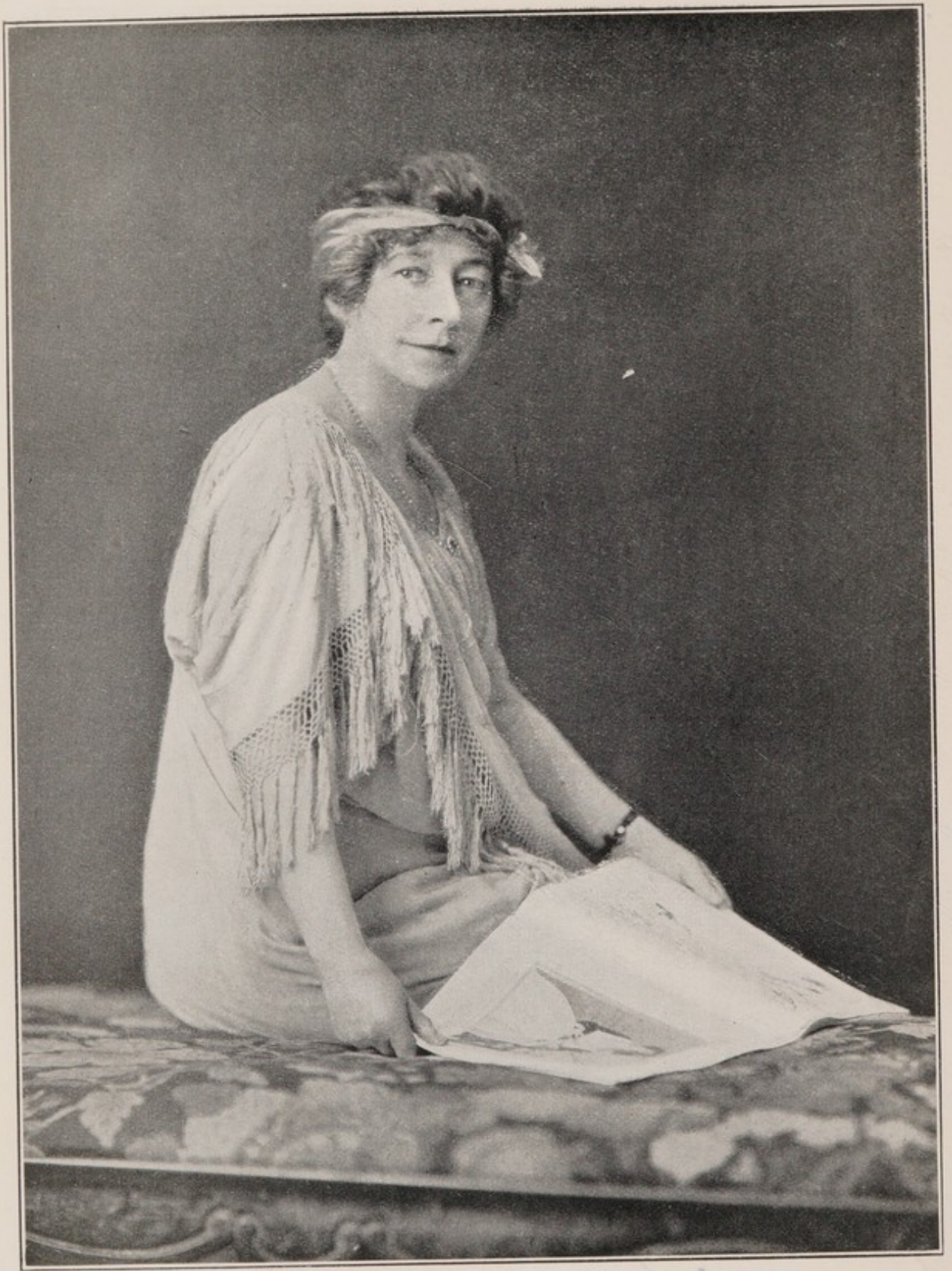
DAME MAY WHITTY, D.B.E., Chairman.