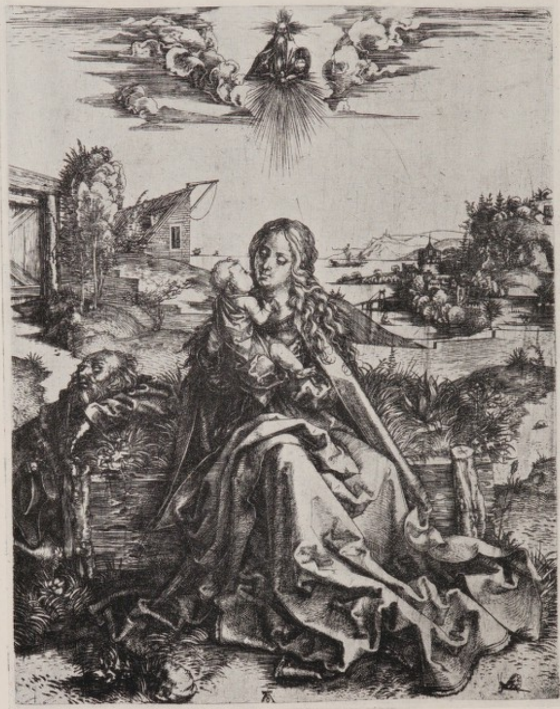
Durer. The Holy Family, with a Butterfly. (See No. 12.)