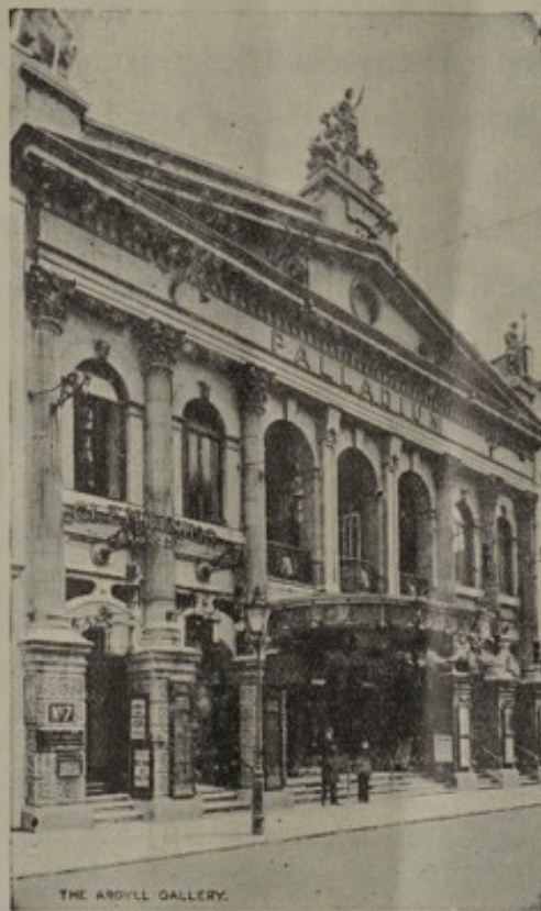
THE ARGYLL GALLERIES, 7, ARGYLL STREET, OXFORD CIRCUS, W. 1.