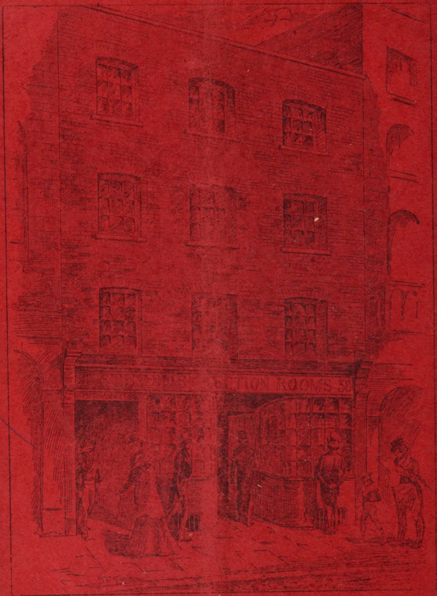
STEVENS IN THE 18TH CENTURY.