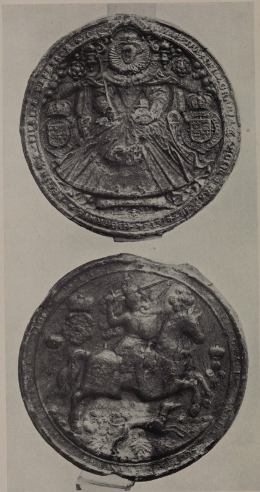
GREAT SEALS OF QUEEN ELIZABETH AND JAMES I. See Item No. 1521.