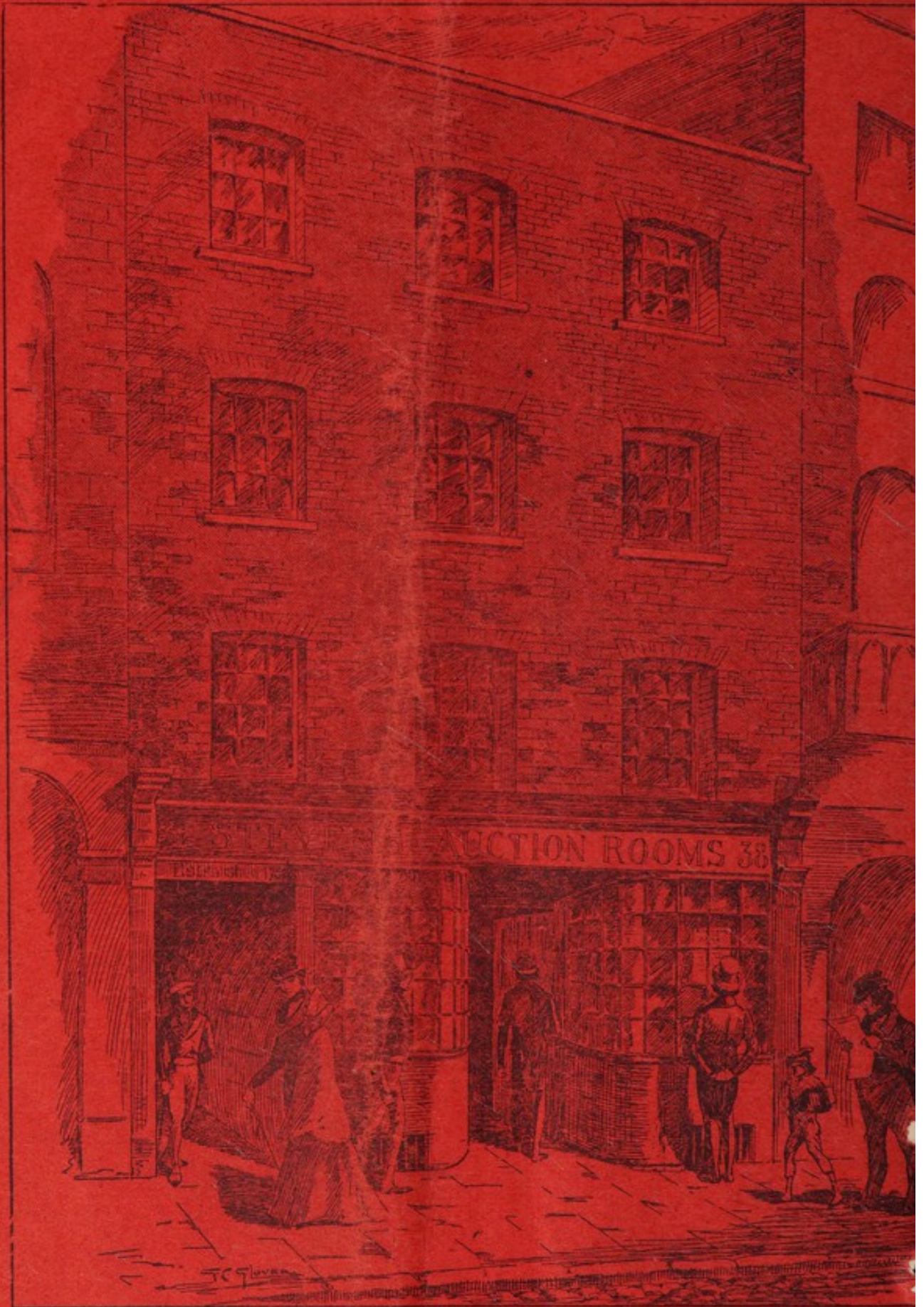
STEVENS' IN THE 18TH CENTURY.