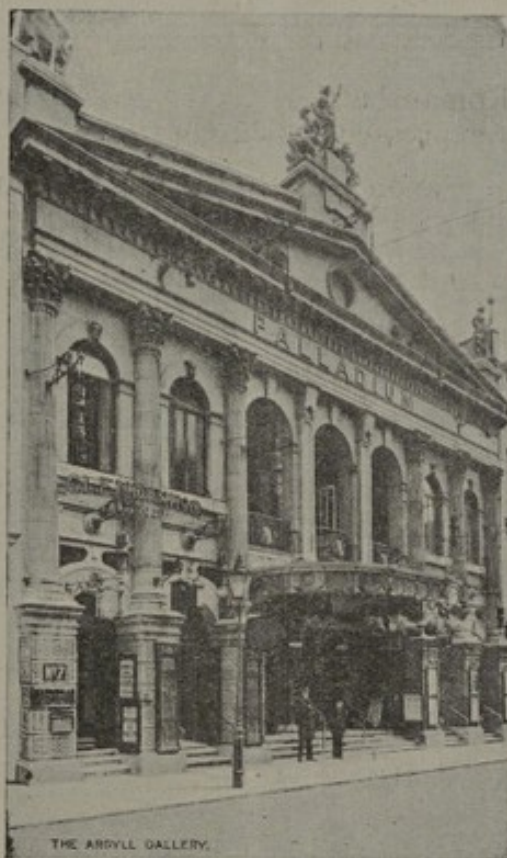
THE ARGYLL GALLERIES, 7, ARGYLL STREET, OXFORD CIRCUS, W. 1.