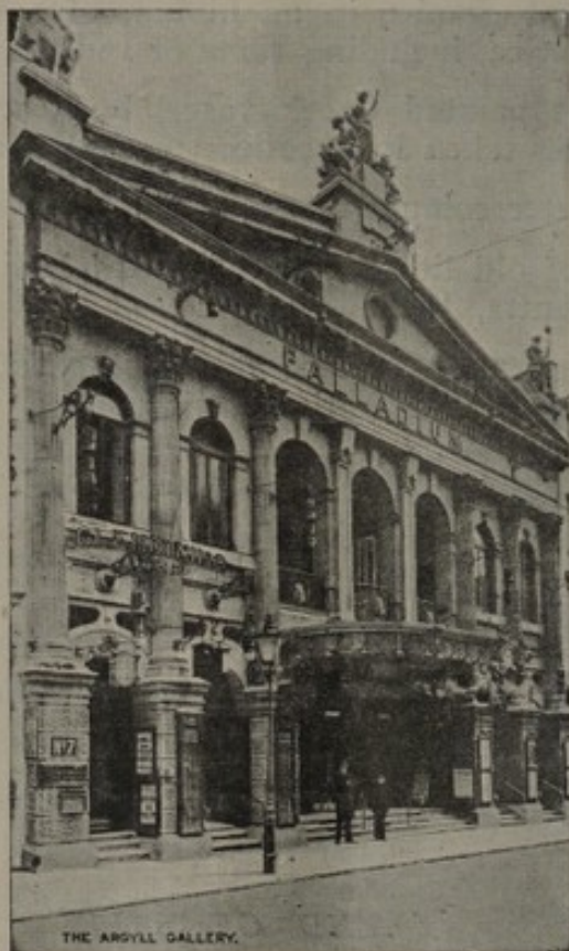
THE ARGYLL GALLERIES, 7, ARGYLL STREET, OXFORD CIRCUS, W. 1.