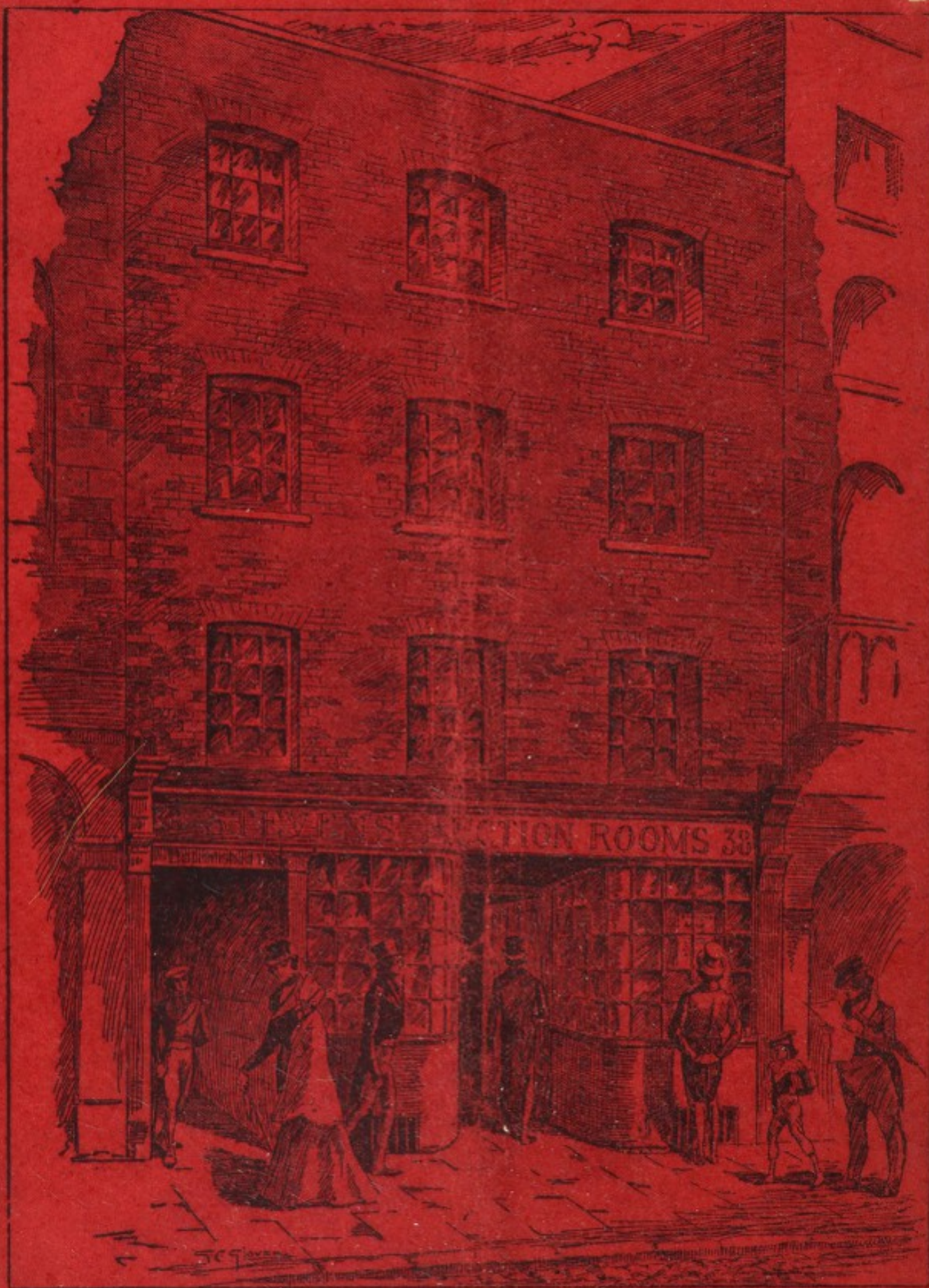
STEVENS' IN THE 18TH CENTURY